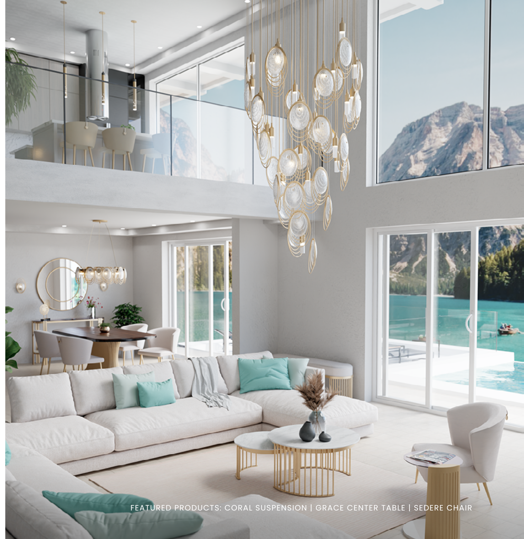
FEATURED PRODUCTS: CORAL SUSPENSION | GRACE CENTER TABLE | SEDERE CHAIR