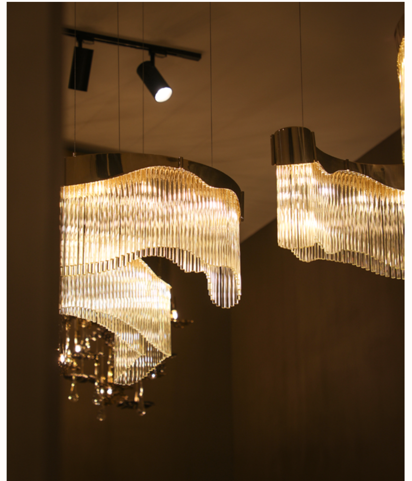
Elegant and expressive, the Flow Suspension is a contemporary statement of freedom and design.