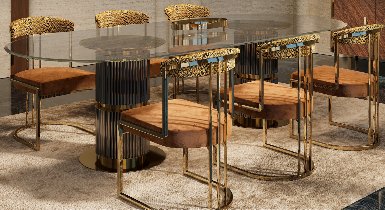
ALSO BY CASTRO: HARP SLIM CHAIR, ELEA DINING TABLE, TIFFANY SIDEBOARD & METIER WALL LIGHT